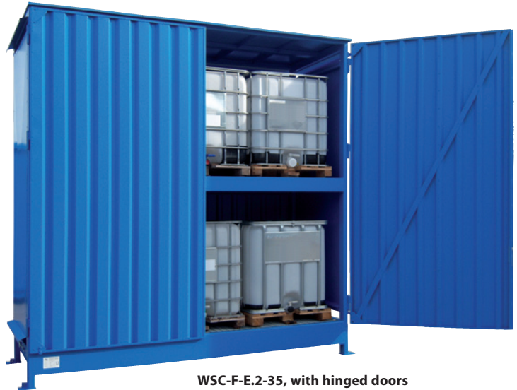
WSC-F-E.2-35, with hinged doors and natural ventilation, Article no. C22-5218-C