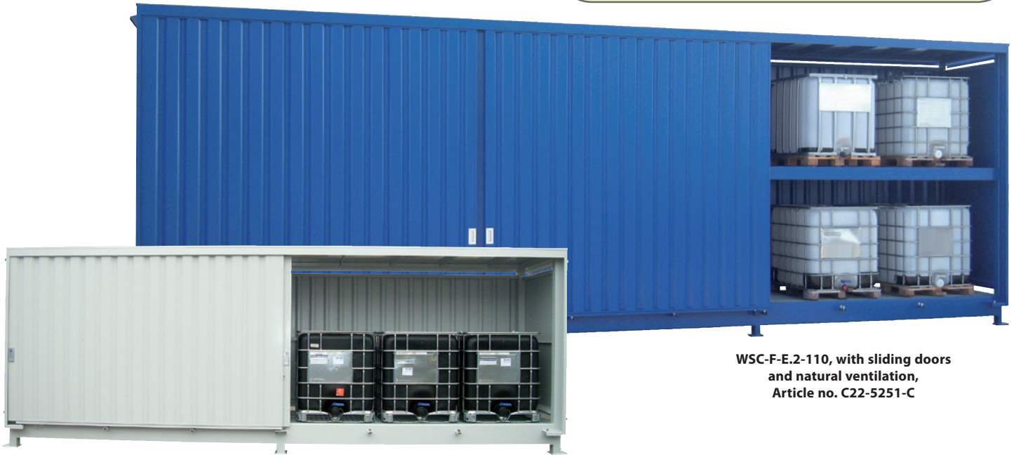
WSC-F-E.2-110, with sliding doors and natural ventilation, Article no. C22-5251-C