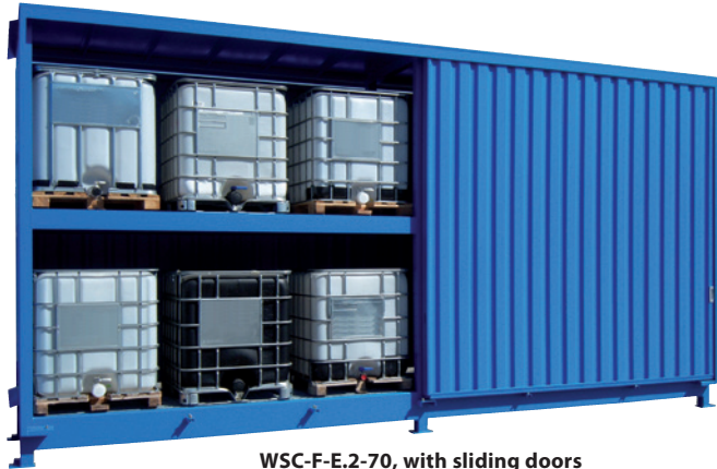
WSC-F-E.2-70, with sliding doors and natural ventilation, Article no. C22-5234-C