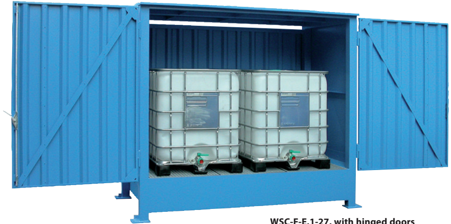
WSC-F-E.1-27, with hinged doors and natural ventilation, Article no. C22-5236-C