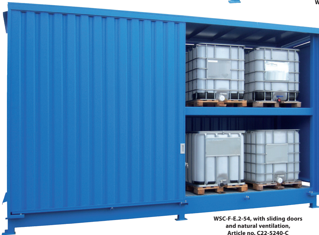
WSC-F-E.2-54, with sliding doors and natural ventilation, Article no. C22-5240-C