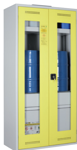
CHS 950-2FAS GL / SiB 30, doors RAL 1018, Article no. B80-6495-A