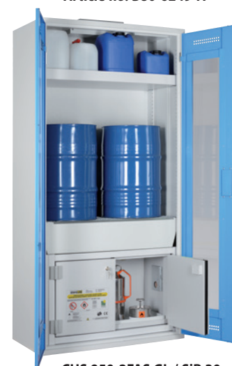
CHS 950-2FAS GL / SiB 30, doors RAL 5015, Article no. B80-6494-A