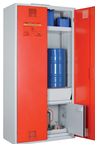
CHS 950-2FAS / SiB 60, doors RAL 3000, Article no. B80-6492-A