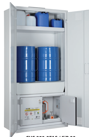
CHS 950-2FAS / SiB 30, doors RAL 7035, Article no. B80-6249-A