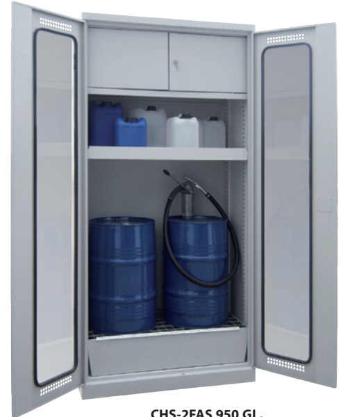
CHS-2FAS 950 GL, Article no. B80-6239-A, with optional safe compartment