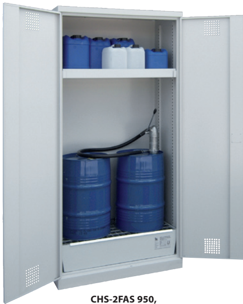
CHS-2FAS 950, Article no. B80-6225-A