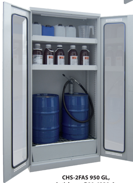
CHS-2FAS 950 GL, Article no. B80-6239-A, with additional tray-shaped shelf