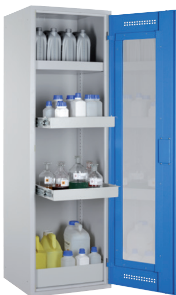
CHS 600 VS GL, door RAL 5015 Article no. B80-6411-A

4 door colors available - at no extra charge!