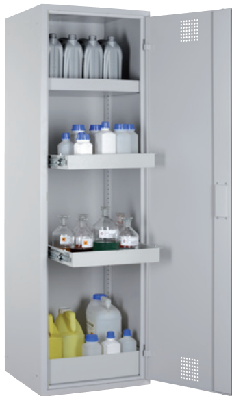
CHS 600 VS, door RAL 7035 Article no. B80-6144-A

4 door colors available - at no extra charge!