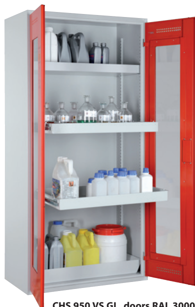
CHS 950 VS GL, doors RAL 3000 Article no. B80-6420-A