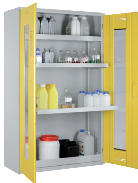
CHS 1200 VS GL, doors RAL 1018 Article no. B80-6424-A