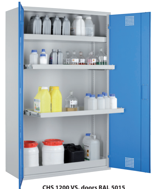
CHS 1200 VS, doors RAL 5015 Article no. B80-6405-A