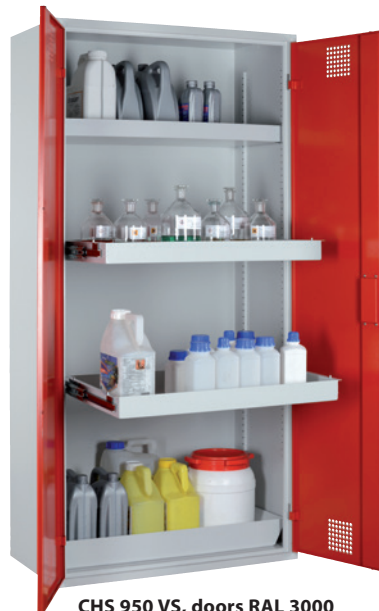
CHS 950 VS, doors RAL 3000 Article no. B80-6403-A