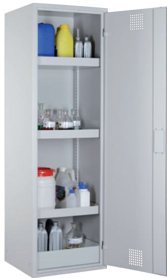
CHS 600, door RAL 7035 Article no. B80-6134-A

4 door colors available - at no extra charge!