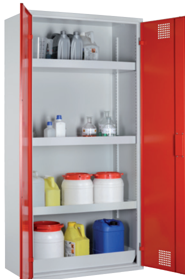
CHS 950, doors RAL 3000 Article no. B80-6169-A