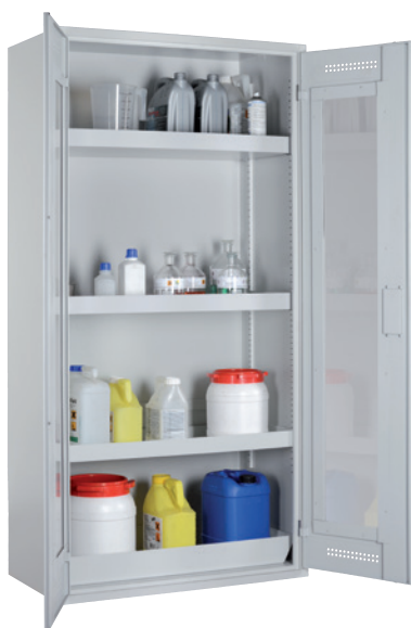
CHS 950 GL, doors RAL 7035 Article no. B80-6216-A