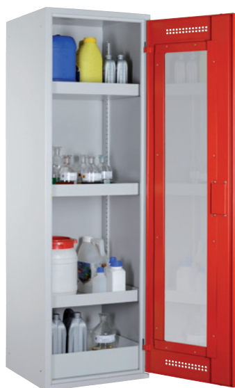
CHS 600 GL, door RAL 3000 Article no. B80-6180-A

4 door colors available - at no extra charge!