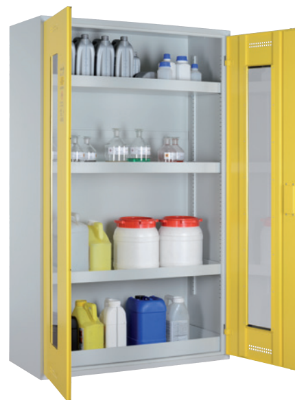
CHS 1200 GL, doors RAL 1018 Article no. B80-6189-A