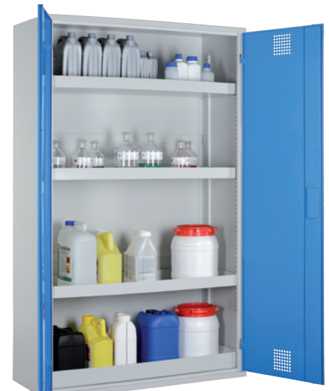
CHS 1200, doors RAL 5015 Article no. B80-6171-A