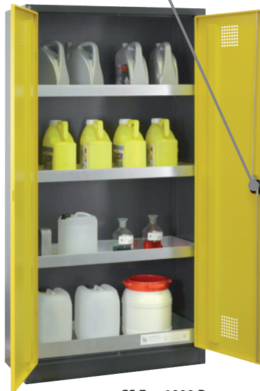
CS Eco 1000 P, Article no. B80-6565-A