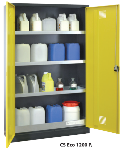
CS Eco 1200 P, Article no. B80-6566-A