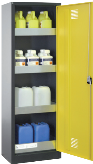
CS Eco 640 P, Article no. B80-6564-A