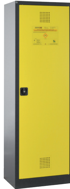
CS Eco 640 P, Article no. B80-6564-A