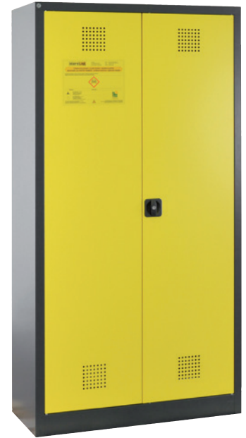
CS Eco 1000 P, Article no. B80-6565-A