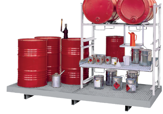
WSP-8-OS with 1 x STR-G and 1 x STR-2 stacking racks and can support