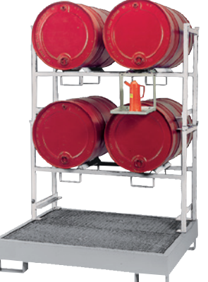
WSP-4-OS with 2 x STR-2 stacking racks and can support