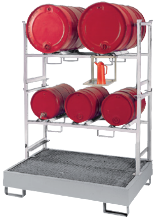
WSP-4-OS with STR-2+STR-3 stacking racks and can support