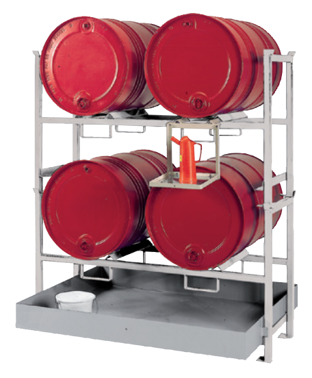
E2 with 2 x STR-2 stacking racks and can support