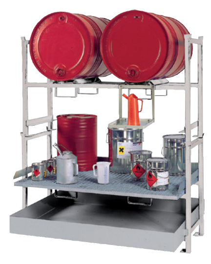
E2 with STR-2 + STR-G stacking racks and can support