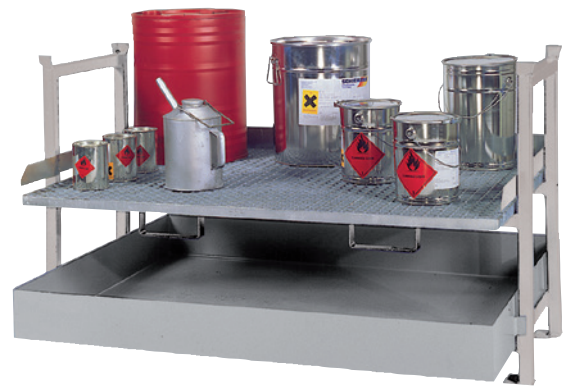
E2 with STR-G stacking rack