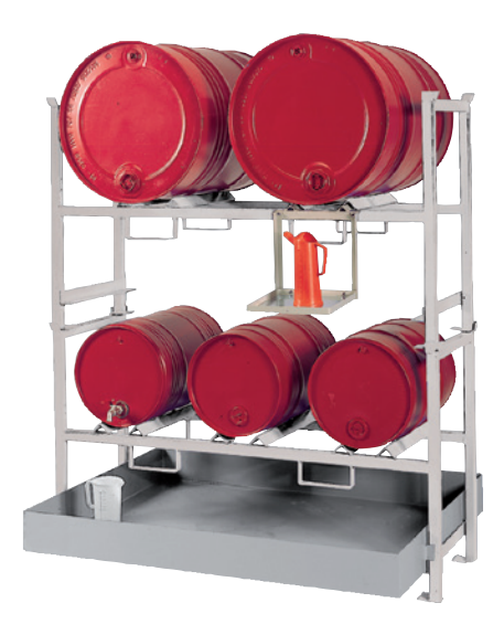
E2 with STR-2 + STR-3 stacking racks and can support