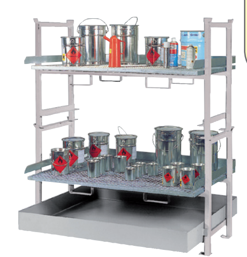
E2 with STR-3 + STR-G stacking racks and can support