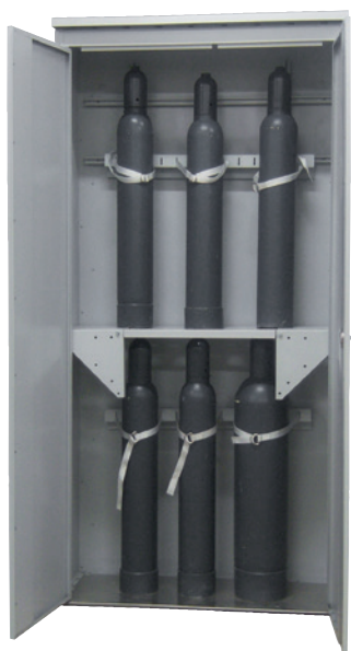
TRG 1050, Article no. C27-3302-B, with optional suspended shelf, Article no. C27-3304-B