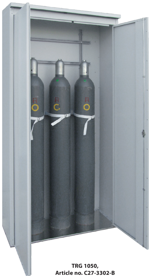
TRG 1050, Article no. C27-3302-B