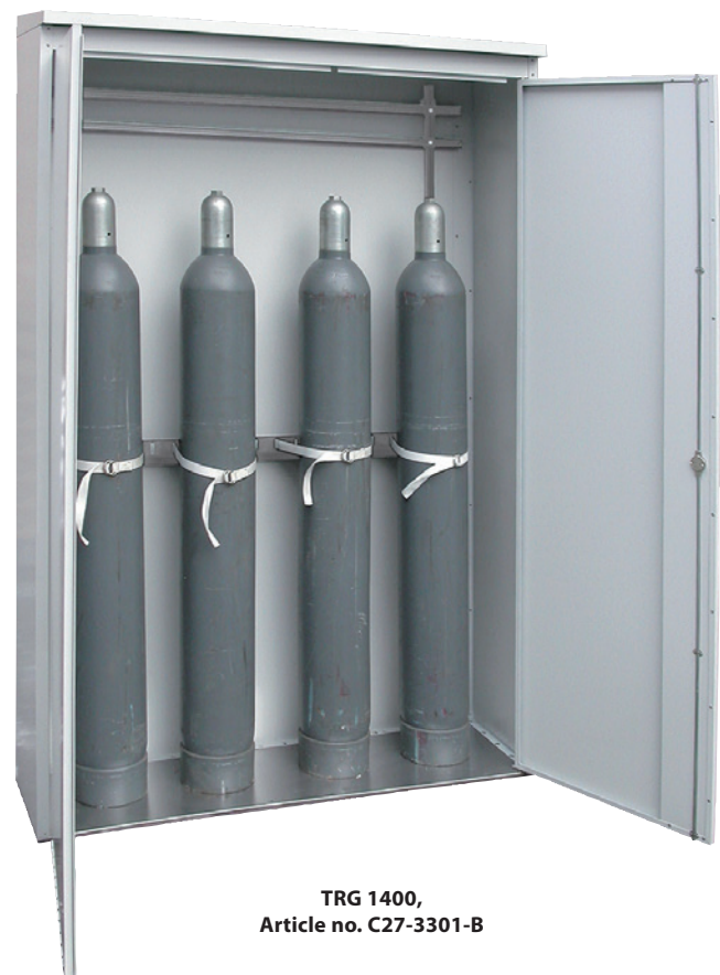
TRG 1400, Article no. C27-3301-B