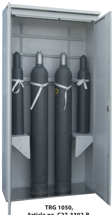
TRG 1050, Article no. C27-3302-B, with two optional side-mounted shelves, Article no. C27-3309-B