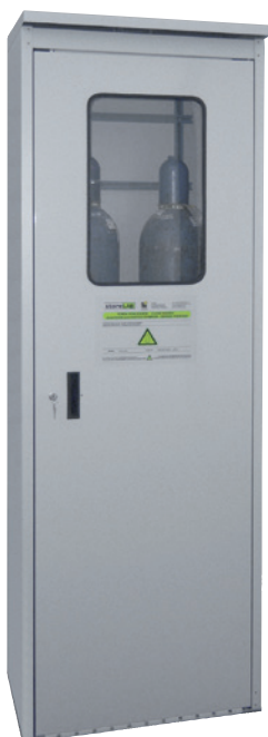
TRG 700, Article no. C27-3306-B