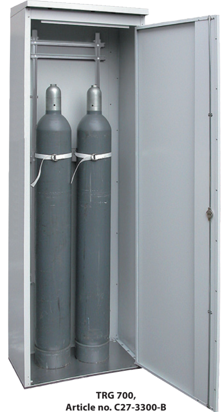
TRG 700, Article no. C27-3300-B