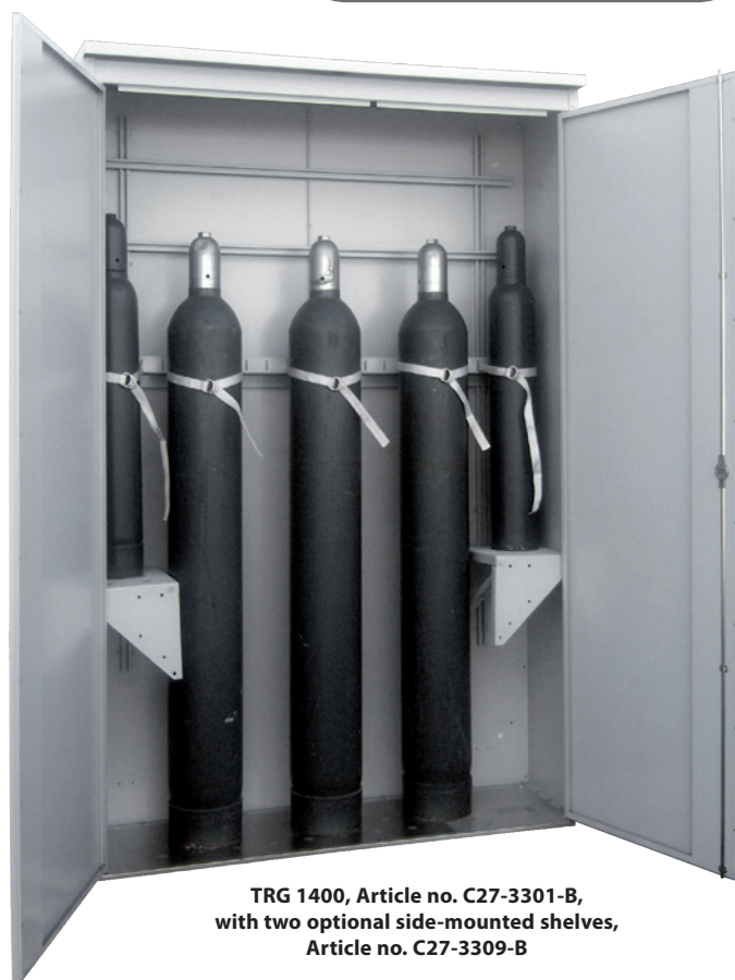
TRG 1400, Article no. C27-3301-B, with two optional side-mounted shelves, Article no. C27-3309-B