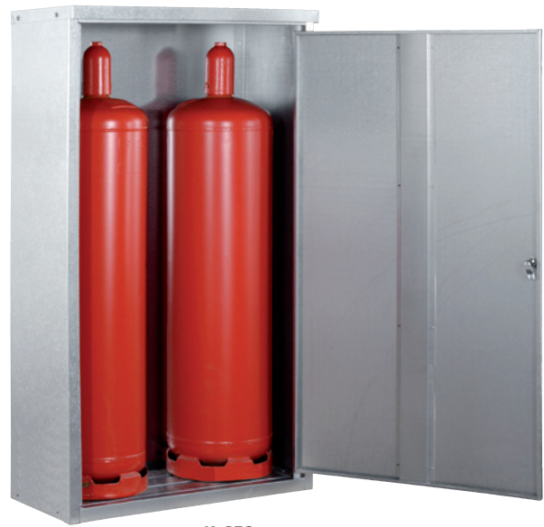
K-GFS 14, Article no. C27-3216-B