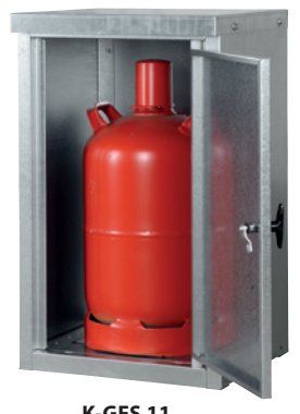
K-GFS 11, Article no. C27-3213-B