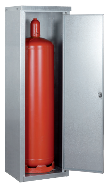
K-GFS 13, Article no. C27-3215-B