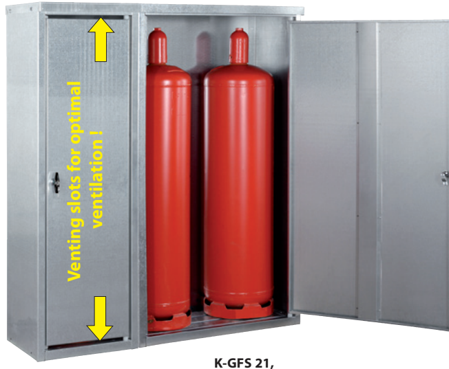
K-GFS 21, Article no. C27-3217-B