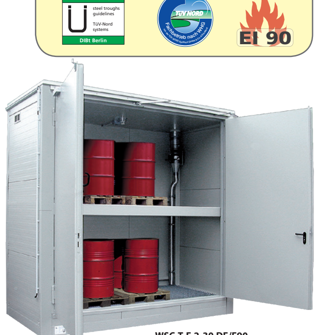
WSC-T-E.2-30 DF/F90, Article no. C64-3001-A

In order to realize the optimum storage conditions a wide range of accessories is available such as technical forced ventilation, lighting, heating, cooling system, door hold-open device, fire warning device!