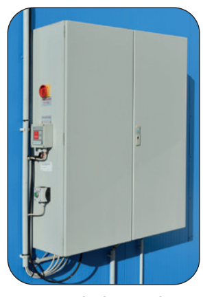
Control cabinet with central control and operating elements