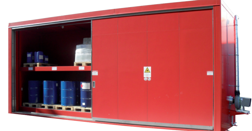
WSC-T-E.2-80 ST/F90, Article no. C64-3013-A, in special color

In order to realize the optimum storage conditions a wide range of accessories is available such as technical forced ventilation, lighting, heating, cooling system, door hold-open device, fire warning device!