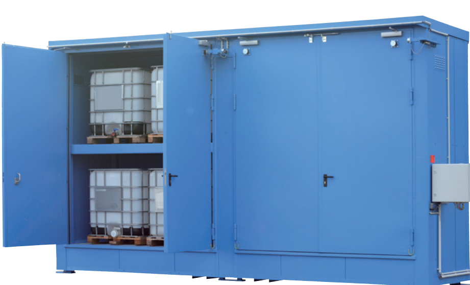
WSC-T-E.2-54 DF/F90, Article no. C64-3004-A

* Compartment dimensions and stated capacities without considering electrical installations (ventilation, heating, etc.)