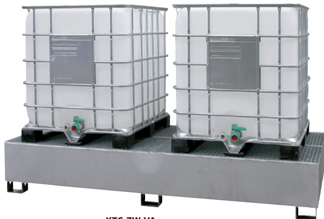
KTC-ZW-VA, Article no. P69-3004-A