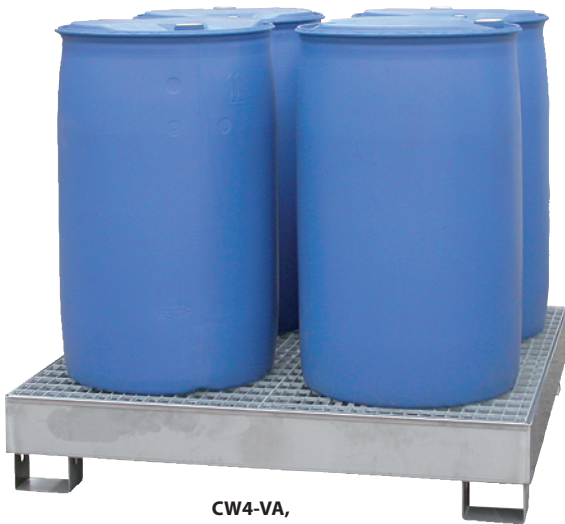
CW4-VA, Article no. P69-3002-A

i Models CW2 and CW4 are particularly suitable for storing 200 liter drums or small containers.