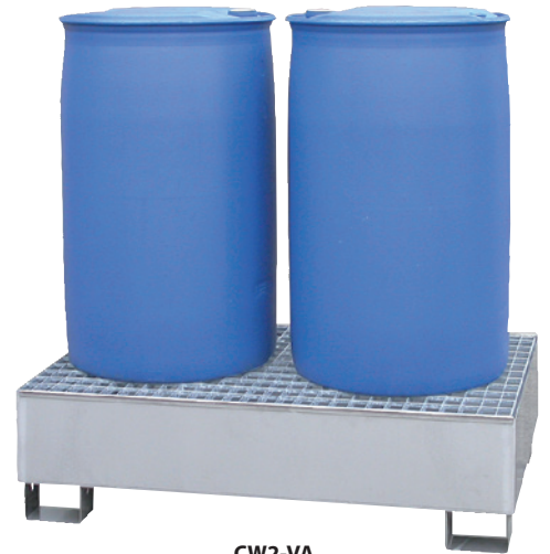
CW2-VA, Article no. P69-3001-A