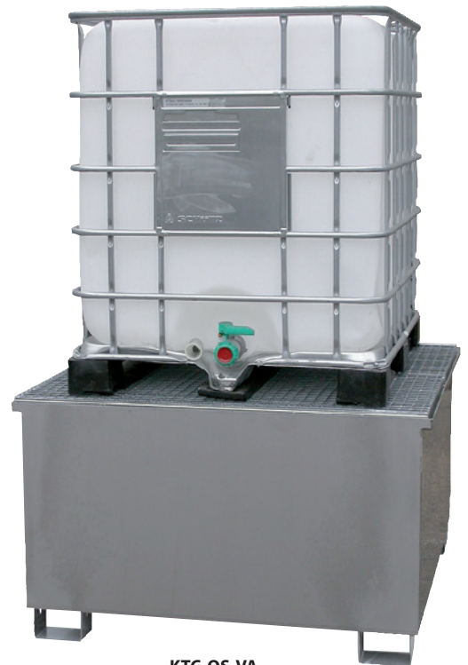
KTC-OS-VA, Article no. P69-3003-A

i Models KTC-OS and KTC-ZW are particularly suitable for storing KTCs / IBCs.