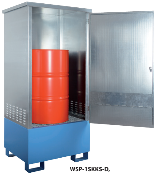
WSP-1SKKS-D, Article no. P21-2480-A