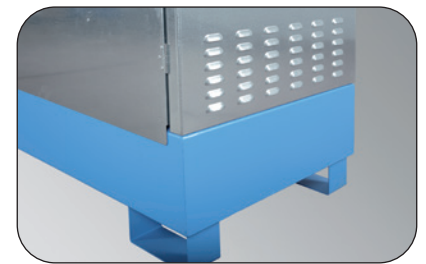
Venting slots in the sidewalls