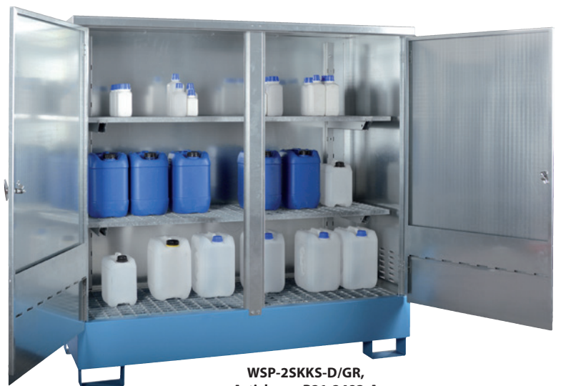
WSP-2SKKS-D/GR, Article no. P21-2483-A