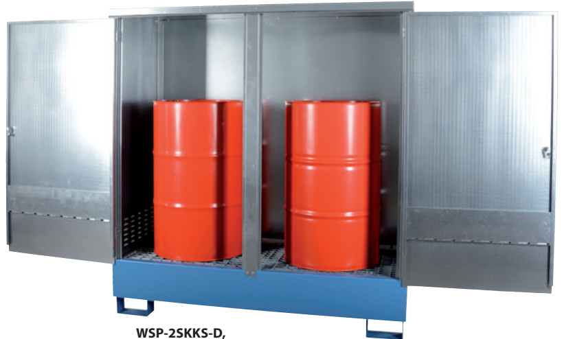
WSP-2SKKS-D, Article no. P21-2481-A