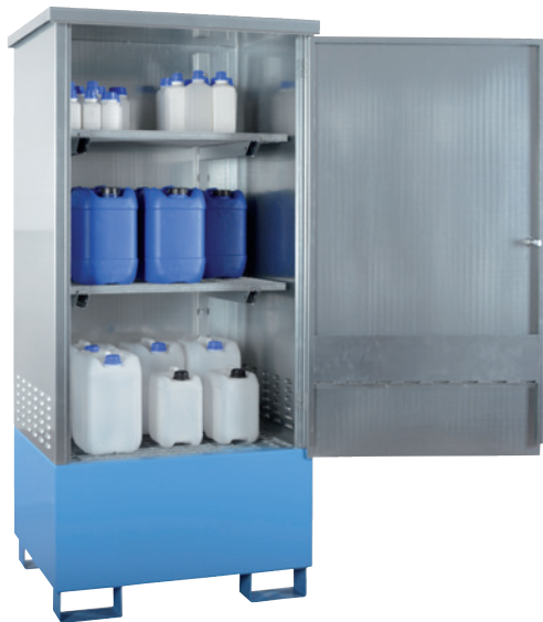
WSP-1SKKS-D/GR, Article no. P21-2482-A