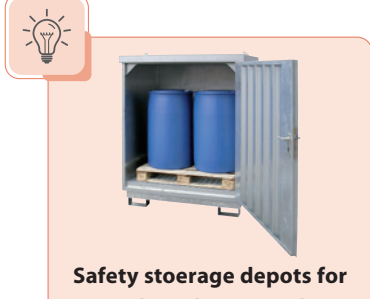
Safety stoerage depots for 200 liter drums can be found on page 146!