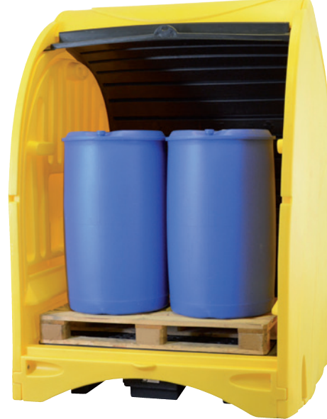
PE-ST-4, Article no. P70-2053-A