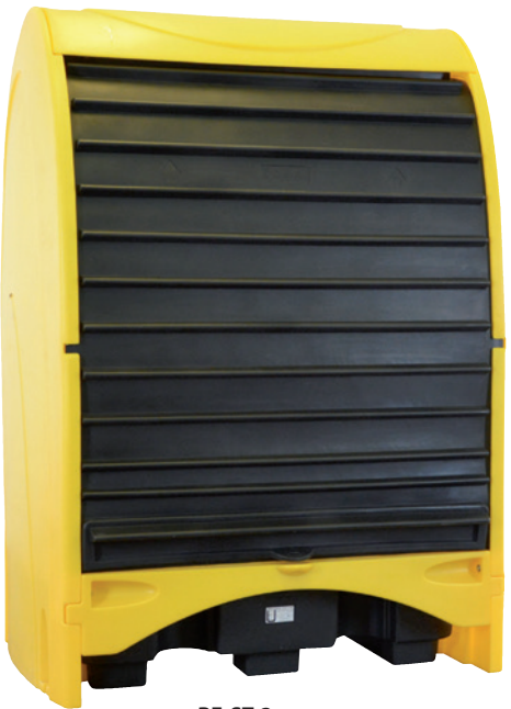
PE-ST-2, Article no. P70-2052-A