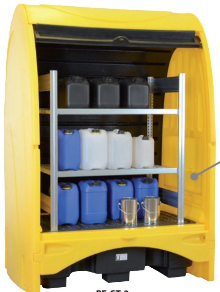
PE-ST-2, Article no. P70-2052-A, with optional shelf set