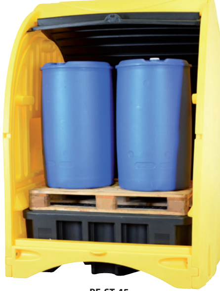
PE-ST-45, Article no. P70-2054-A