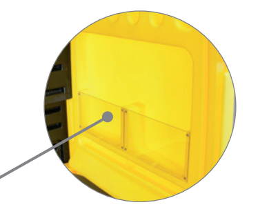
Integrated document storage