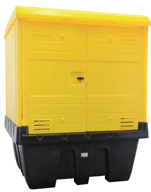
PE-ST-KT, Article no. P70-2055-A, with double wing door lockable