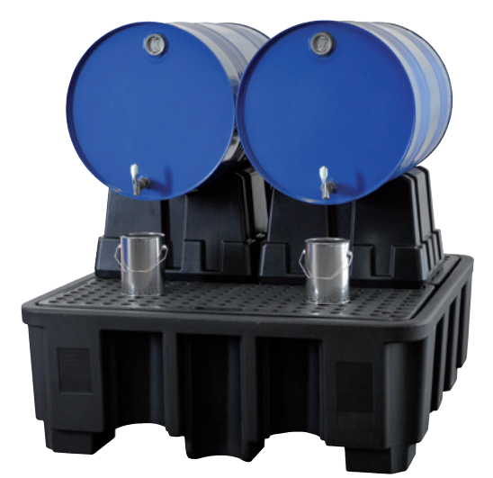
FB 2-Combi, Article no. P70-2033-A, e.g. 2x 200 liter drum

Sump trays are not included in the scope of delivery!