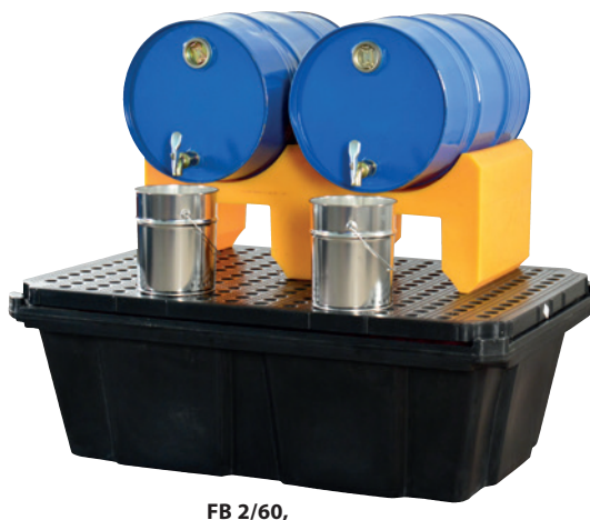
Article no. P70-7113-A