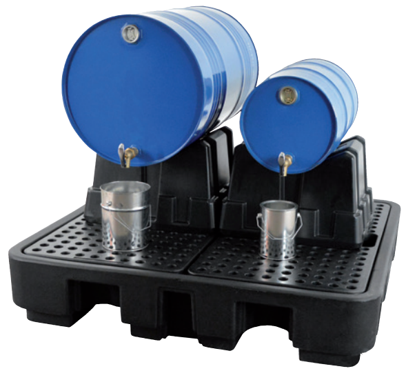
FB 2-Combi, Article no. P70-2033-A, e.g. 1x 200 liter drum and 1x 60 liter drum

Sump trays are not included in the scope of delivery!