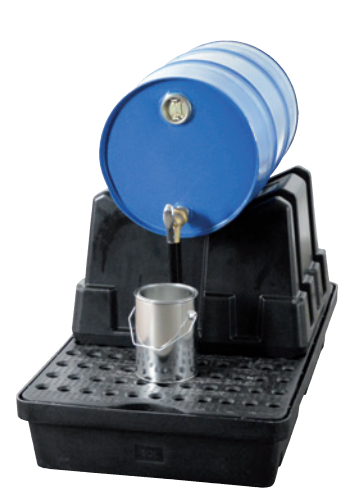
FB 1-Combi, with 60 liter drum, Article no. P70-2031-A

When not in use, the drum stand can be stacked to save space!